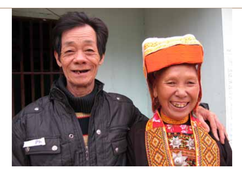
A couple from Na Ngoa Village who worked with CARE and its partners to contribute their ideas and perspectives during the CVCA process.

Most households practice subsistence agriculture, with major crops including rice, maize, cassava, sweet potatoes and taros. There is limited cultivation of soy beans, peanuts and a few fruits and vegetables. Most households also practice animal husbandry, raising pigs, poultry and fowl for food and sale. Cattles are raised to work the fields.