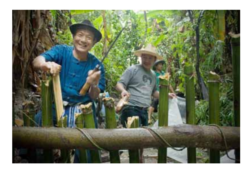
Community members in Nan Province, Northern Thailand, are working together to build a dam that will protect them from more frequent flooding in the area.

At the international level, discussions tend to focus on identification of the most vulnerable countries.