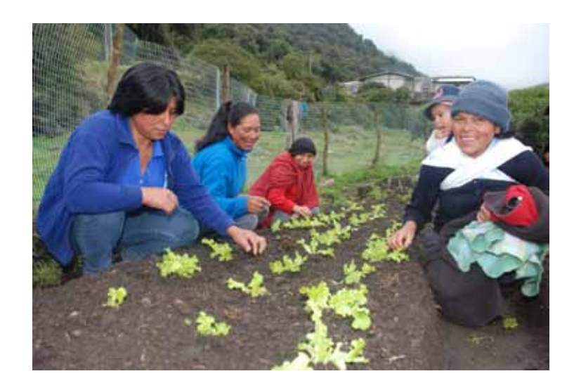
In 'El Valle del Tambo' valley in Papallacta, Ecuador, CARE is working with women farmers to protect their crops from increasing cold winds and frost.

In order for adaptation efforts to be successful, vulnerability assessment must go beyond identification of vulnerable countries. Processes for vulnerability analysis and adaptation planning must involve all relevant stakeholders, including local communities and, in particular, the most vulnerable members of those communities. These processes must examine the social, economic and political drivers of vulnerability in order to identify the most vulnerable people within countries and communities and ensure that their needs, priorities and aspirations are reflected. This enables policymakers and adaptation practitioners to target resources and interventions where they are needed most.